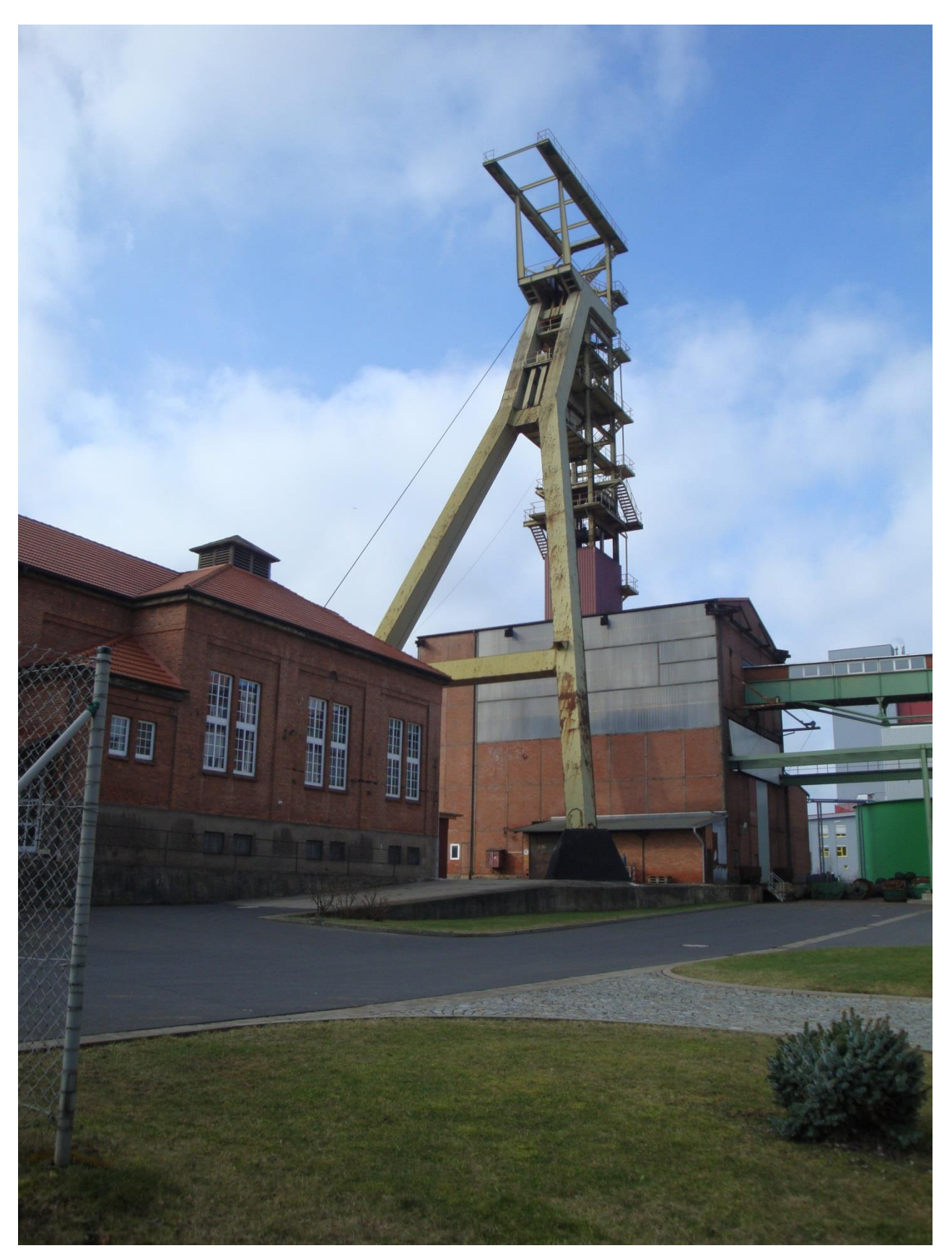
figure 1: shaft tower shaft II with hauling engine